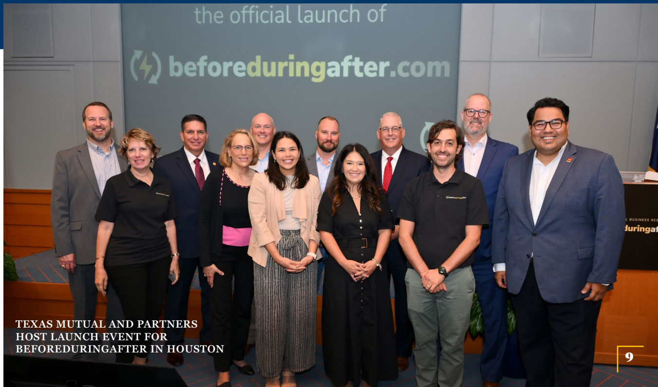
TEXAS MUTUAL AND PARTNERS HOST LAUNCH EVENT FOR BEFORDURINGAFTER IN HOUSTON